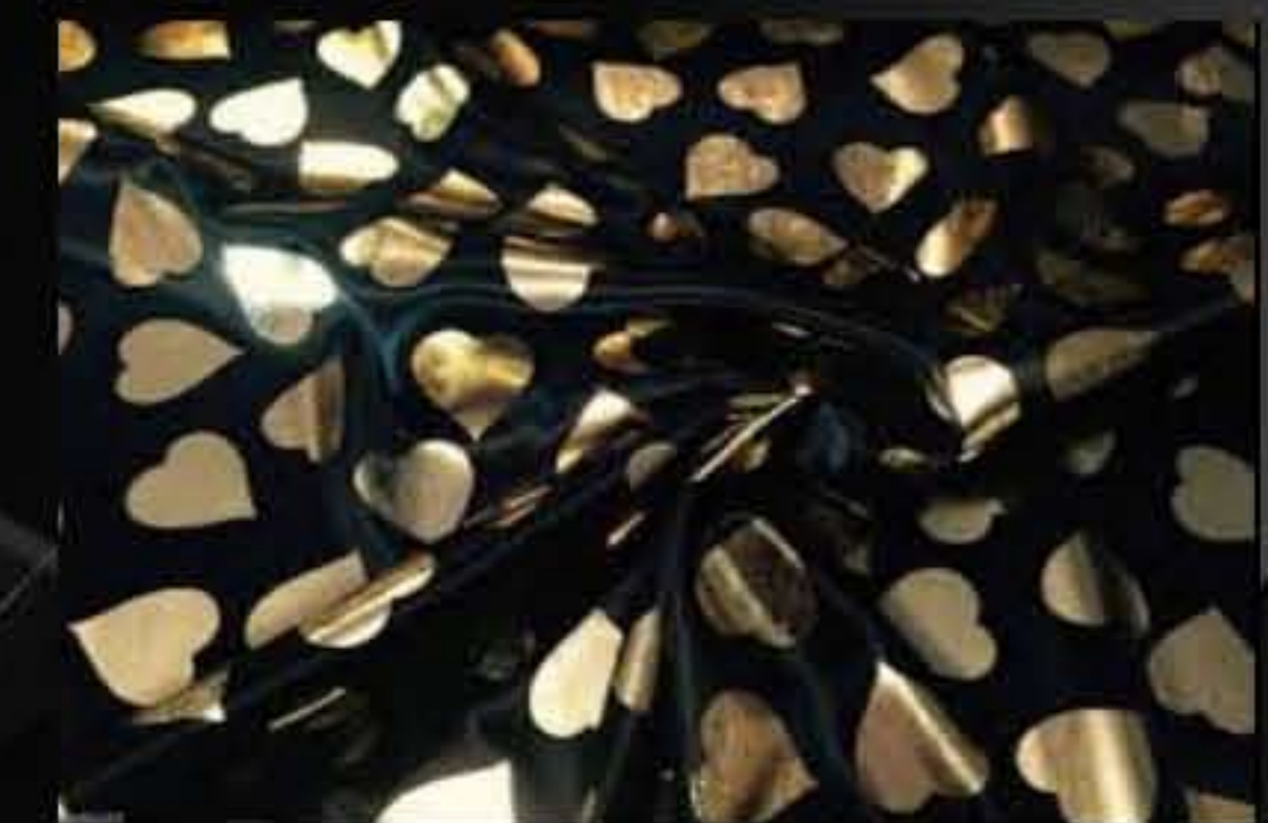
Metal Foil Printing