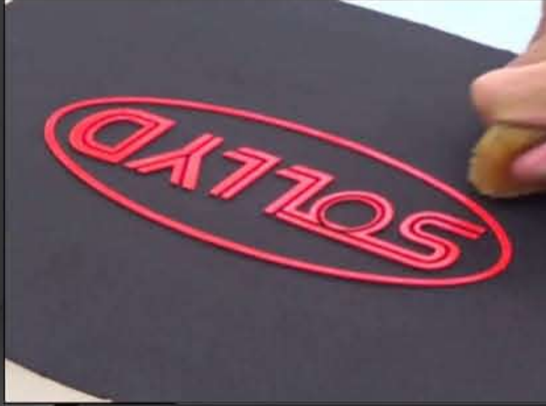
High Density Printing