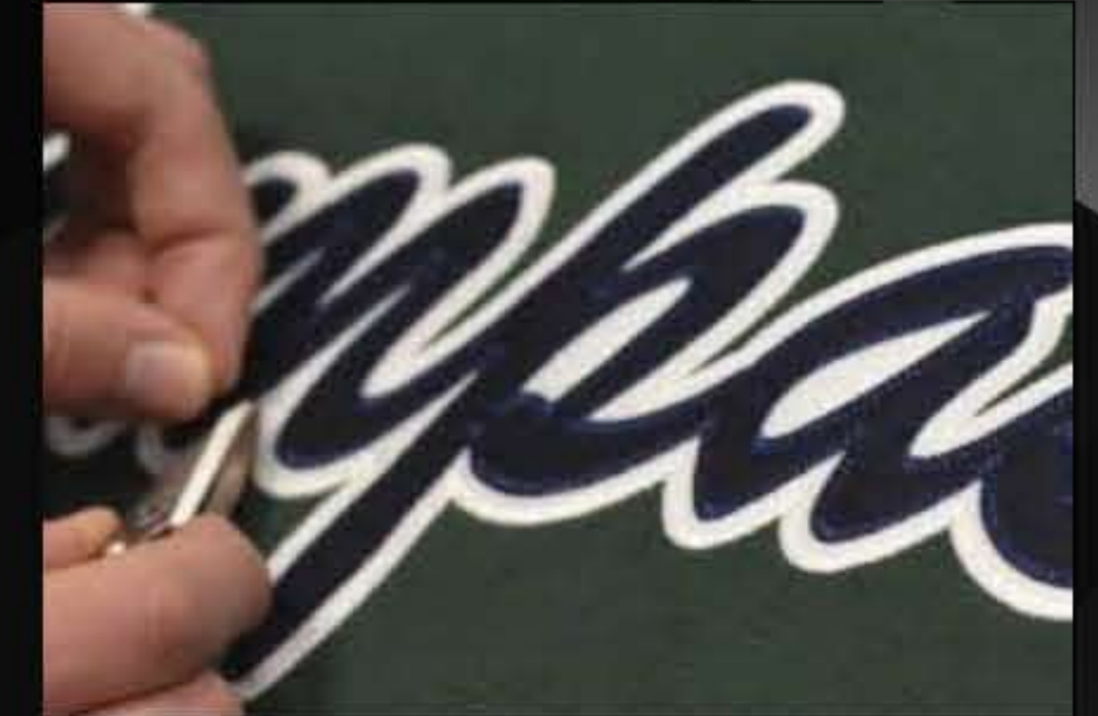
Tackle Twill Embroidery